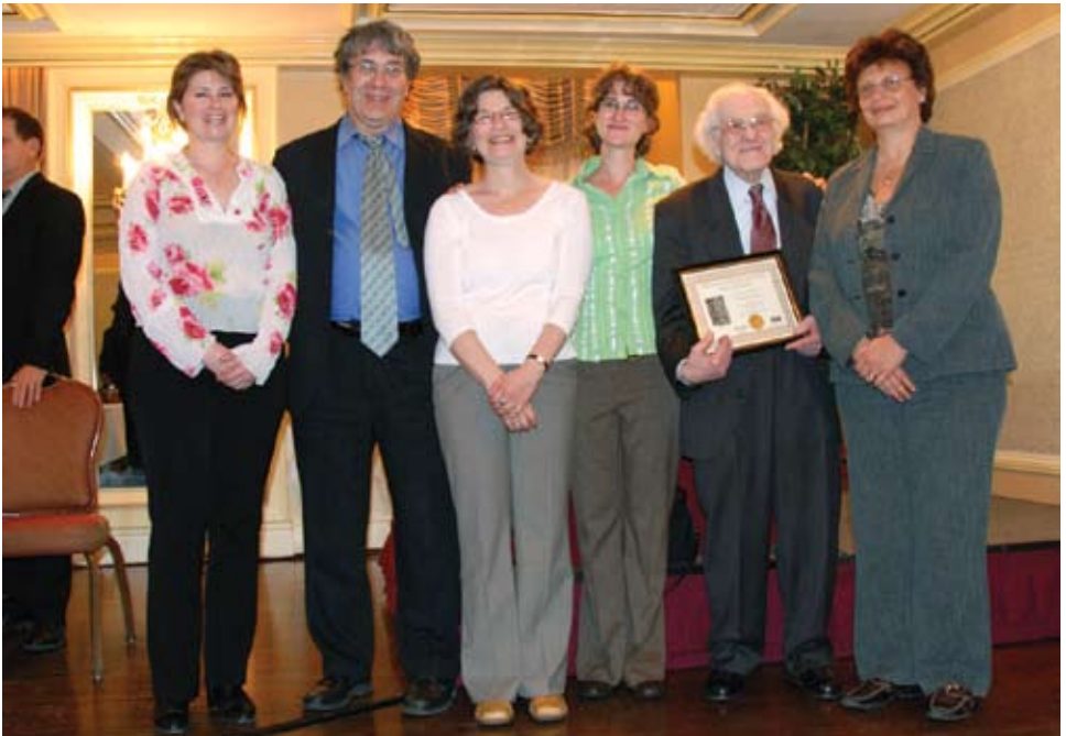
The Kahan family