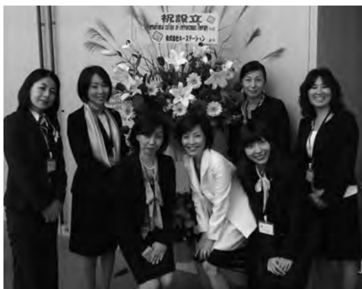
The fine Symposium staff extended gracious Japanese hospitality to all the speakers, special guests, and delegates.