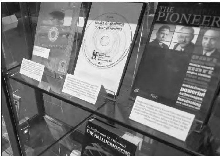
The ISF documentaries Feed Your Head (2010); Masks of Madness: Science of Healing (1998); and The Psychedelic Pioneers on display.