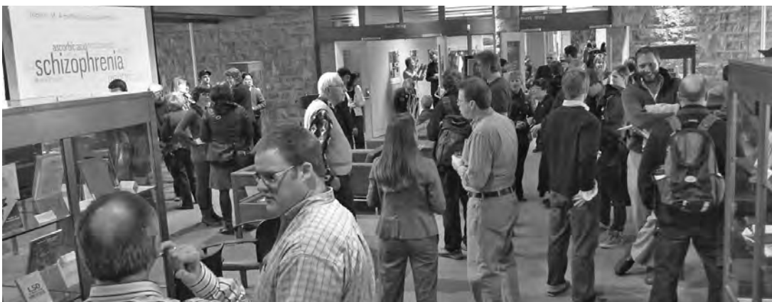
The opening of the Abram Hoffer Orthomolecular Collection was well attended.